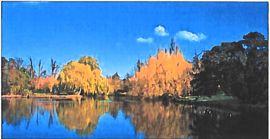
Beddington Park by Kemal Atli

If you have any information that could assist the investigation, contact police on 0207 230 8898 quoting reference 4005167/ 21.